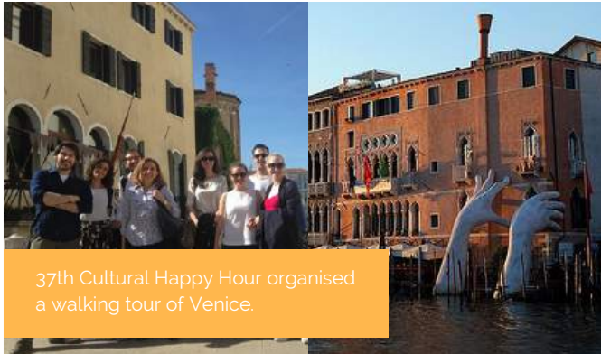
37th Cultural Happy Hour organised a walking tour of Venice.

Brussels, Paris, Barcelona and now Venice! In a Cultural Happy Hour first, an evening of cultural discovery and networking was organised in Italy.